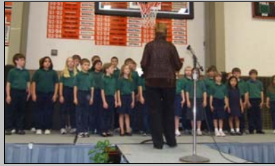
St. Patrick's School Choir