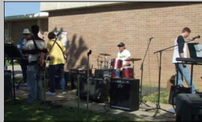
Blind Boys Blues Band