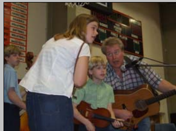
The Oliphant Family