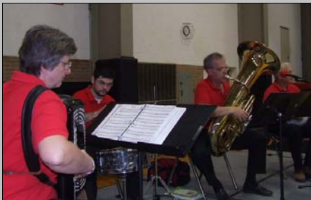
The Jack Suite Band